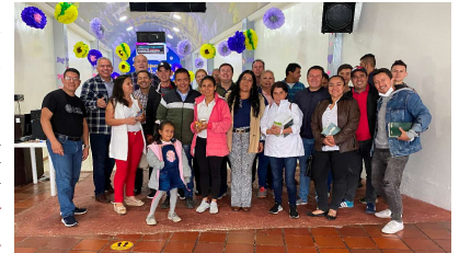
Meeting with 2 dozen pastors in preparation for Bible distribution in 6 communities.

Feeling threatened by all of this God stuff, I was determined to disapprove Christianity and I needed a Bible to do it. So, I stole one! You could say that I Stole Glory that day because it led me straight to the feet of Jesus.