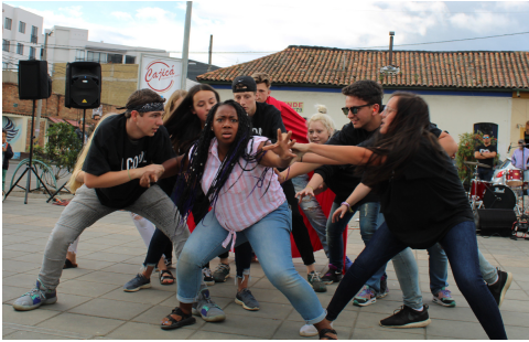
Drama in the park!

One church, ten years of outreaches. Since 2009 Metro City Church, Detroit has sent more than 200 of their youth to partner with us in Evangelism. We have done presentations in schools, shopping centres, jails and parks.